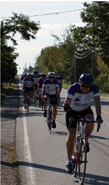
(Some of our 160

http://www.farleyfoundation.org/extrapages/2011_ride_for_farley_cyclists.html